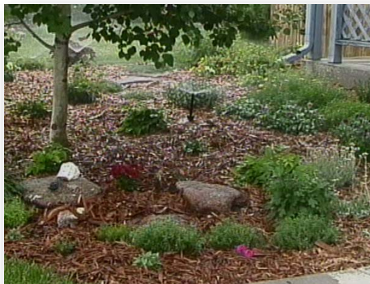
Figure 4. Wood/bark chip mulch in the perennial and shrub bed greatly enhances soil tilth over time.

Wood/bark chips are not recommended in vegetable or annual flowerbeds where the soil is routinely cultivated to prepare a seedbed.