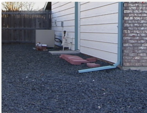
Figure 8. Rock mulch is great for non-crop areas

Rock mulch may be desirable in some specialty gardens, like a cacti garden, rock garden, or alpine garden.