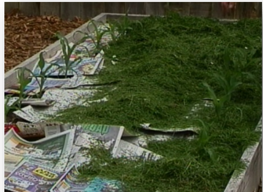
Figure 7. Use newspaper under the grass or wood/bark chip mulch to shut out light and stop weed seed germination. Apply it only in thin layers to prevent a carbon to nitrogen imbalance.

In situations where the newspaper is wet from rains or sprinkler irrigation, it rapidly decomposes. Where it remains dry (like over a drip irrigation system) it may still be intact at the end of the growing season. Any remaining newspaper may be cultivated into the soil in the fall.