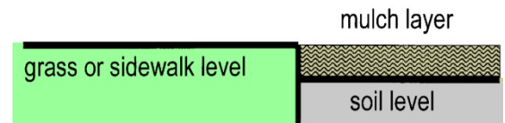
Figure 2. To keep mulch in place, drop the soil level in the mulch bed so the top of the mulch is at the grass or sidewalk level.

An effective alternative is to round down the soil level along the edge of the bed. This gives a nice finished edge at grade level and creates a raised bed effect for the flowerbed. [Figure 3]