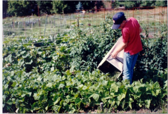
Figure 6. Grass clipping are great for the vegetable garden and around annual flowers. Directly from the bag, place them around the plants in thin layers, allowing each layer to dry before adding more.