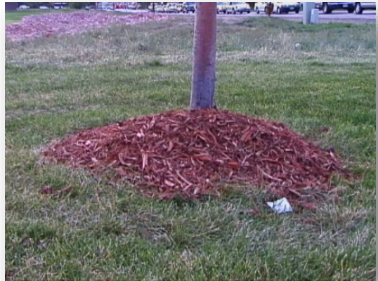
Figure 5. Never make a “mulch volcano”. It leads to decay of the bark and interferes with trunk taper. Keep mulch back six inches from the trunk.