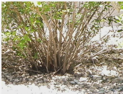
Figure 9. Rock mulch interferes with shrub rejuvenation pruning. Here a wood/bark chip mulch will help enhance soil tilth.

Rock mulch may interfere with shrub rejuvenation. Refer to CMG GardenNotes #619, Pruning Flowering Shrubs , for details on shrub pruning. Because shrubs in rock mulch cannot be effectively renewed by rejuvenation pruning, they are replaced when the shrubs become overgrown and woody. In this situation, it would be better to consider the rock mulch as “deferred maintenance” rather than “low maintenance”. [Figure 9]